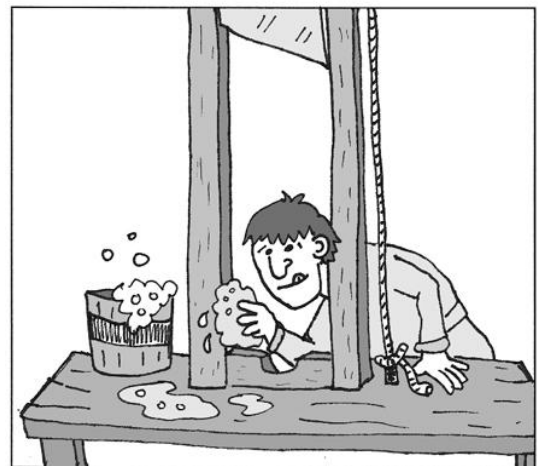
Jacques Dubeuf, guillotine cleaner. First and last day on the job.